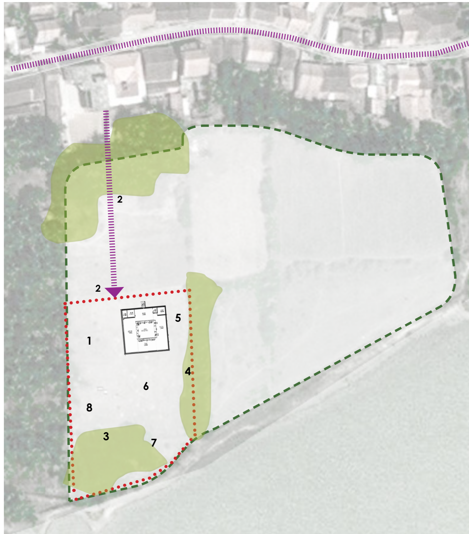
5. SPEAKER CORNER